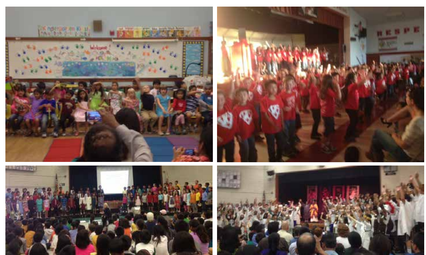
Top left: Niles school kindergarteners Bottom left: Gomes 3rd graders