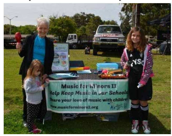
Ducks for Bucks Event

This is just a preview of the exciting things to come in our 27th year of service. But by far the most exciting thing in MFM II is when we recruit a volunteer to join us in bringing music to children in need. So let's get the word out everywhere that MFM II offers you one of the most worthwhile volunteer opportunities to serve and make