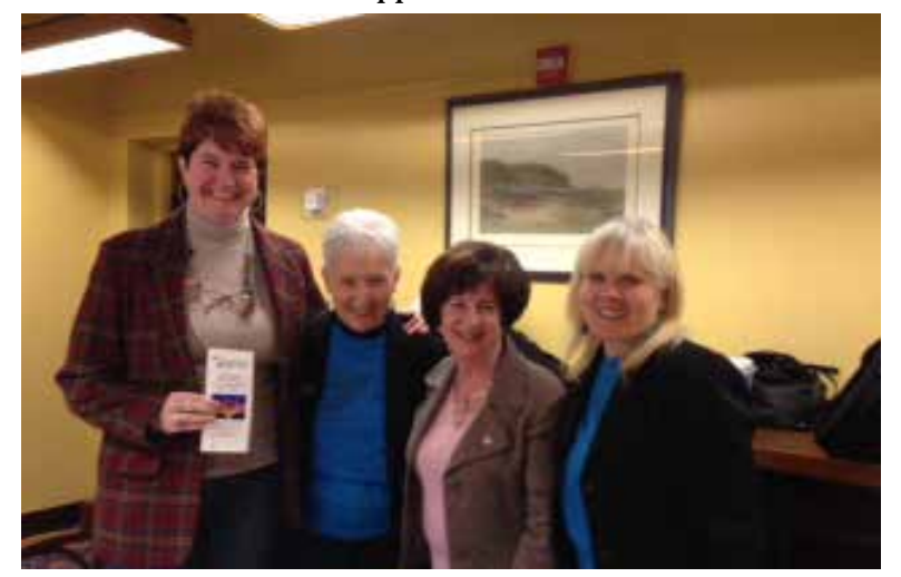
Tri-Valley Evening Rotary Club on March 6th at Castlewood Country Club