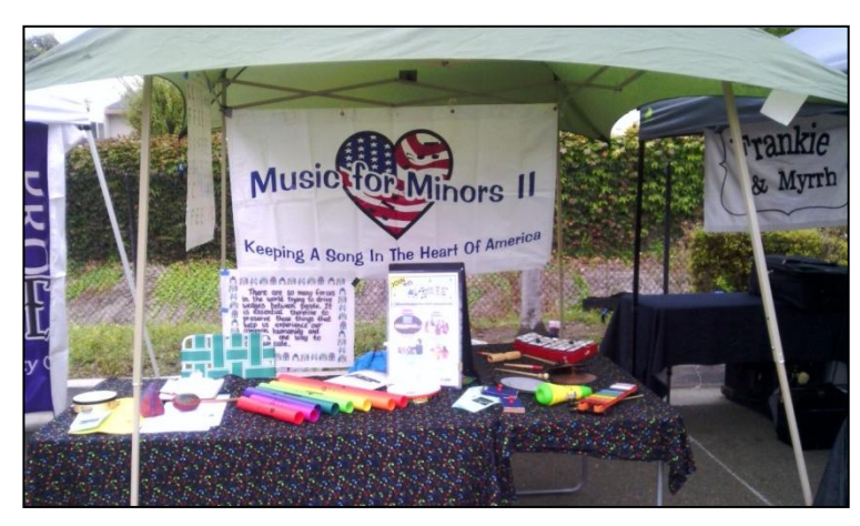
Castro Valley Fall Festival Recruitment Booth