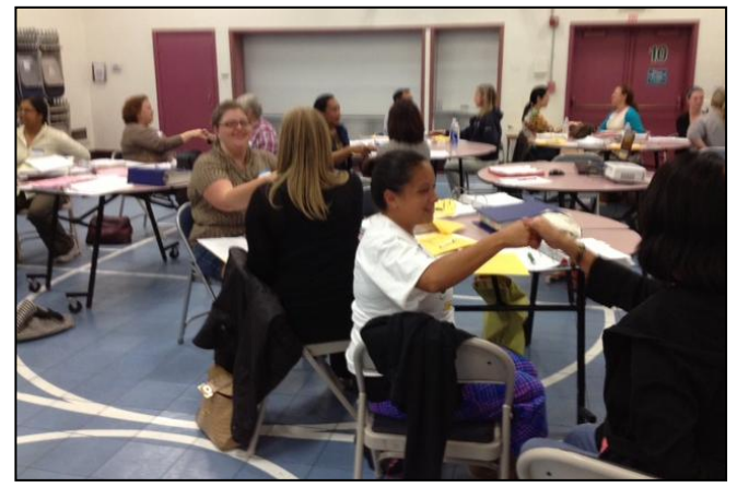
"Buddies & Pals" C.V. Training Class