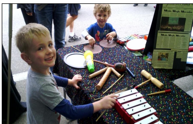
A budding musician or two for sure...