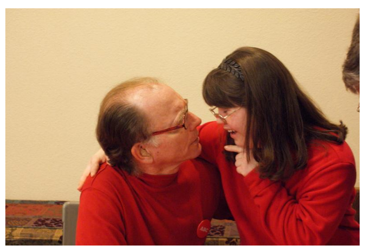
Sharing personal experiences and making lifelong connections.