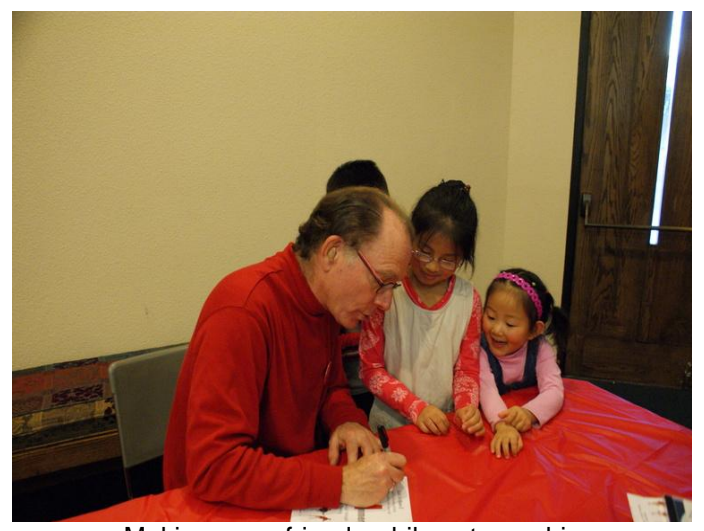
Making more friends while autographing.