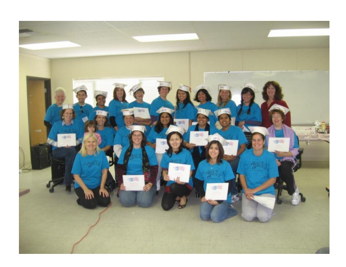
Certified Trainees in the Class of 2009 - Ready for musical fun with children!

We are in need of the CV graduation pictures so that we can highlight them in the next issue.