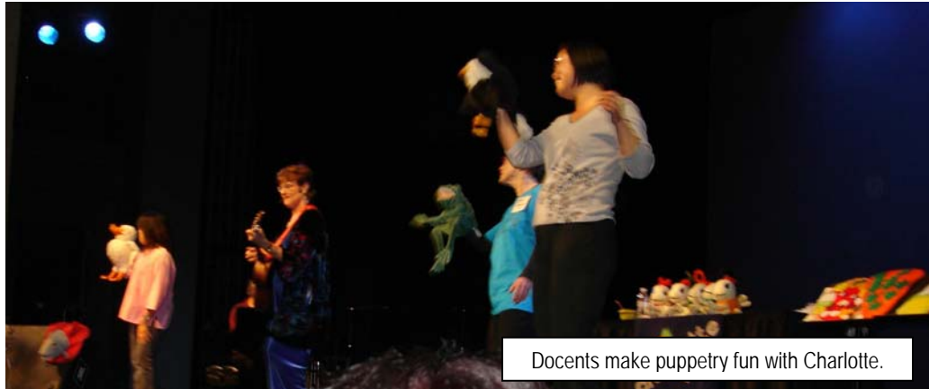
Docents make puppetry fun with Charlotte.