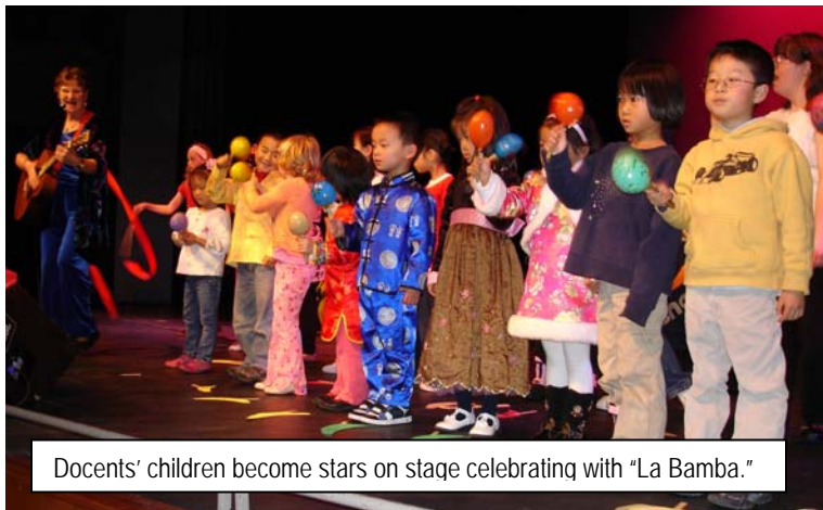
Docents' children become stars on stage celebrating with "La Bamba."