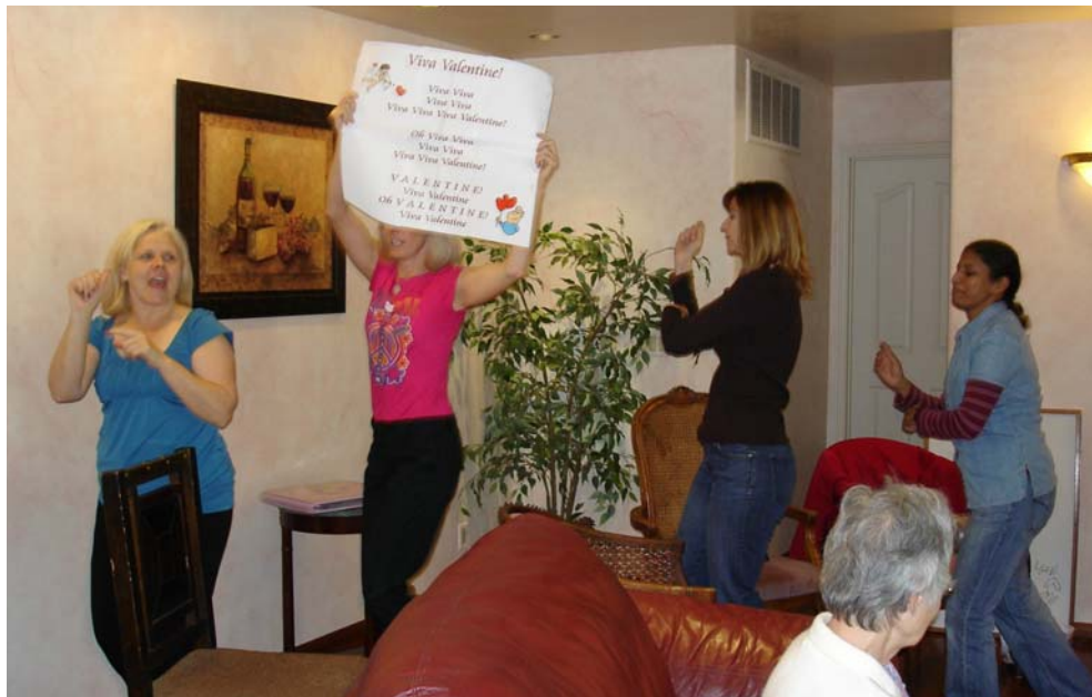
You go girls! It's "Viva Valentine" time!