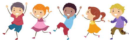
Dancing / Movement