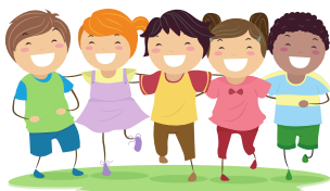
Singing / Signing