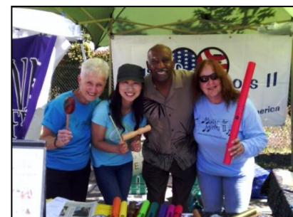
Castro Valley Fall Festival Booth