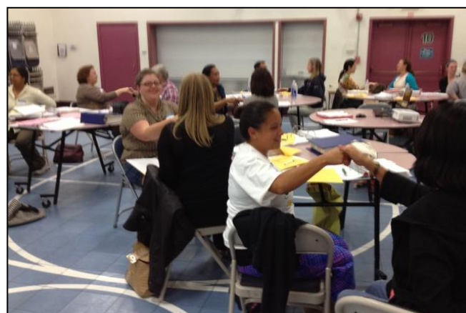
"Buddies & Pals" C.V. Training Class