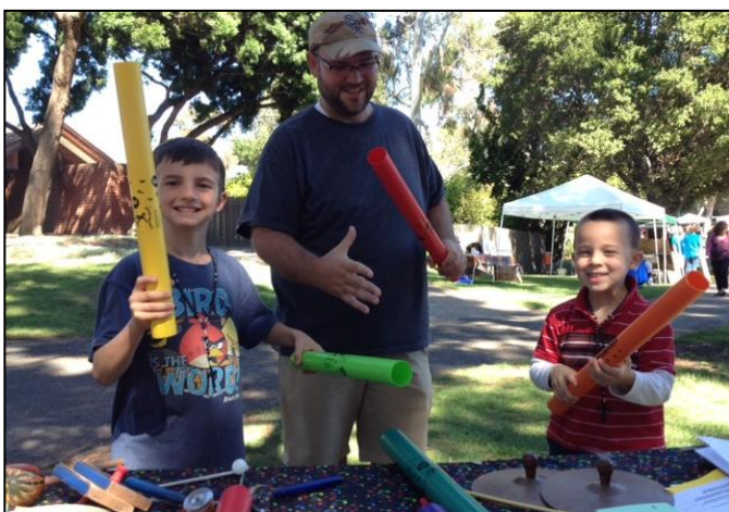
Dad joins in for boom-whacking

Welcome to the music, the magic, and the memories of Music for Minors II!