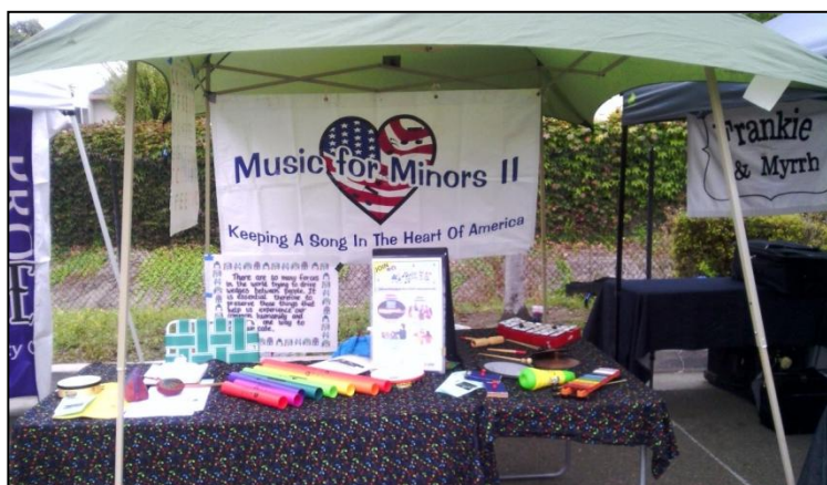
Castro Valley Fall Festival Recruitment Booth