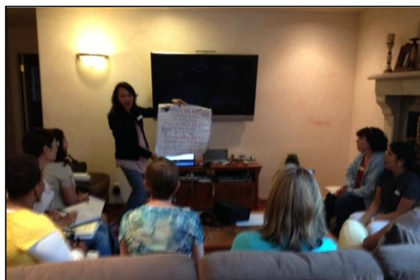
Docent Sharing Session #1 - Fremont