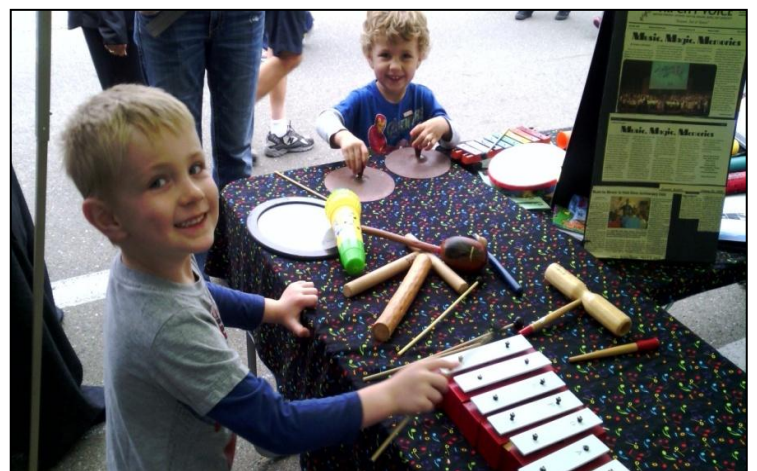
A budding musician or two for sure...