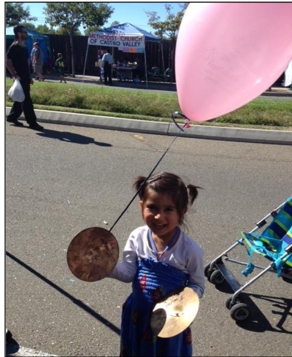
Strike up the Band, C.V. Fall Festival