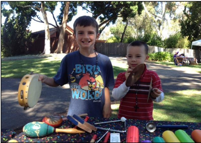
A Brothers' Band, Newark Days Booth