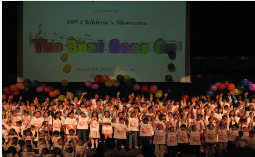
(Pictured: 300 MFMII students together on stage at Harbor Light in Fremont.)

MFMII soon spread to Parkmont and Maloney Schools in Fremont and some Newark Unified School District schools such as Musick and Lincoln. Soon Sinnott Elementary School in Milpitas became the first MFMII School in that area. Recruitment in the Milpitas area subsequently brought 6 schools from that area to our program and MFMII served that school district for almost 10 years until they hired music specialists in all of their schools. MFMII kept music alive until funding was acquired.