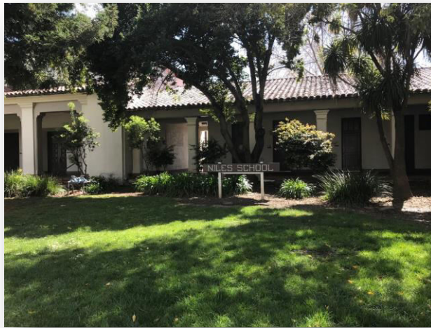
(Pictured, Niles Elementary School)