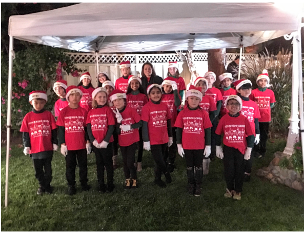
Niles Rotary Holiday Party