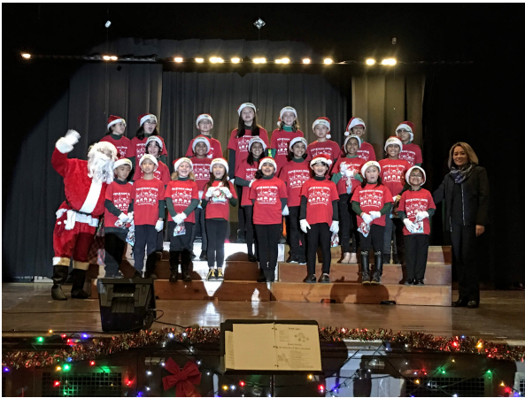
Annual Holiday Concert at Niles School