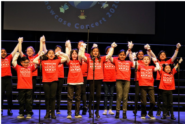
MFMII Children's Showcase Concert at Harbor Light