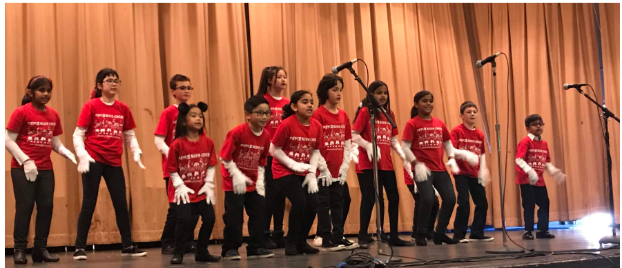
League of Volunteers Gala