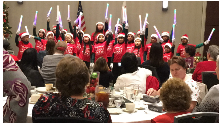
Performance for the American Business Women's Association