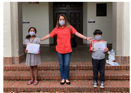
Choir members pick up their certificates and music face masks.