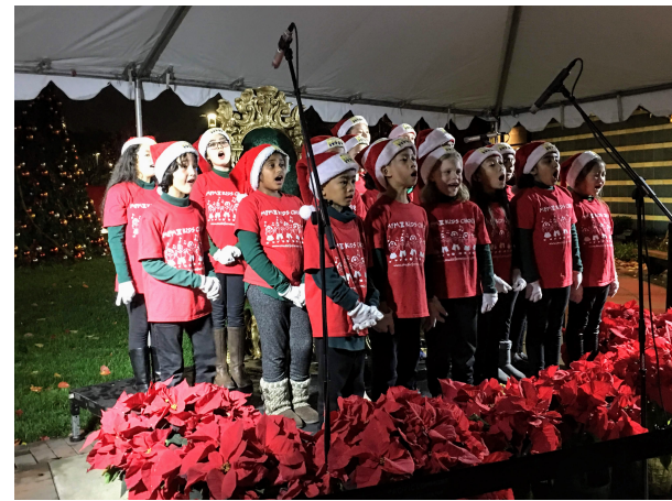
Pacific Commons Tree Lighting